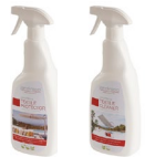
Textile cleaner & protector 2 scrubbing sets 3 application cloths Textile protector 750 ml Textile cleaner 750 ml

Before use, you can apply an invisible film to make your cushions stain and water repellent by using a textile protector. For general cleaning you can use water and a pH-neutral soap or Textile Cleaner.